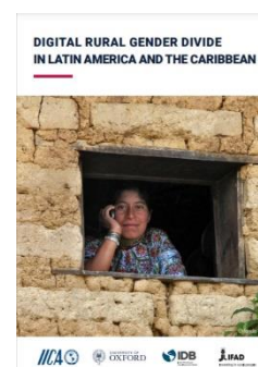
Digital rural gender divide in Latin America and the Caribbean

Source: Center for Knowledge Management and Horizontal Cooperation Services.