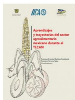
Aprendizajes y trayectorias del sector agroalimentario mexicano durante el TLCAN