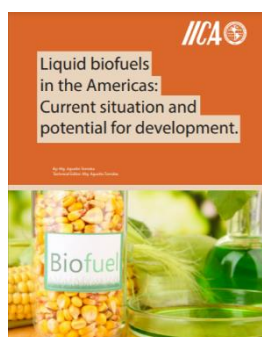
Liquid biofuels in the Americas: Current situation and potential for development