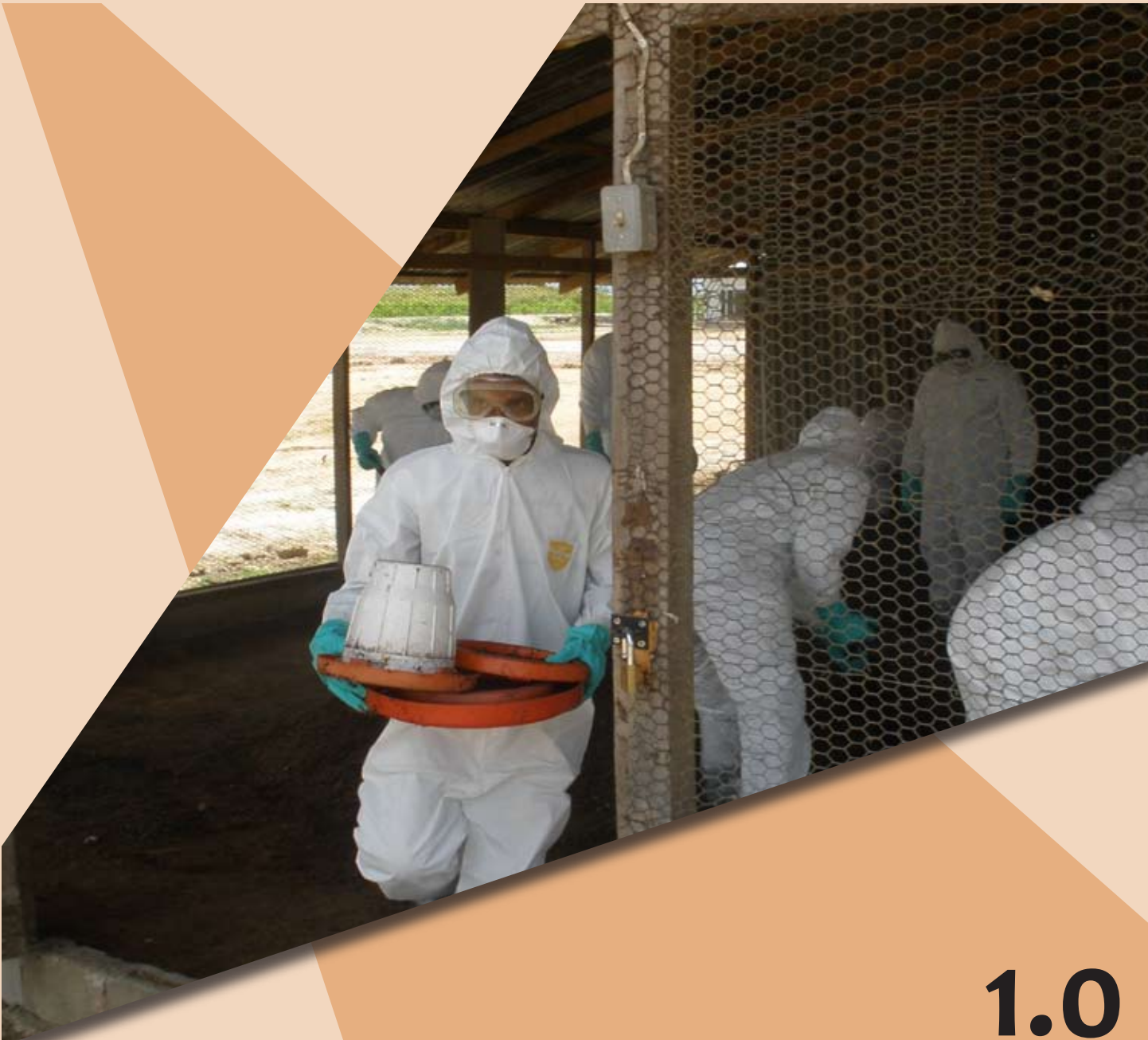
Avian Influenza simulation exercise held in Trinidad in April 2009