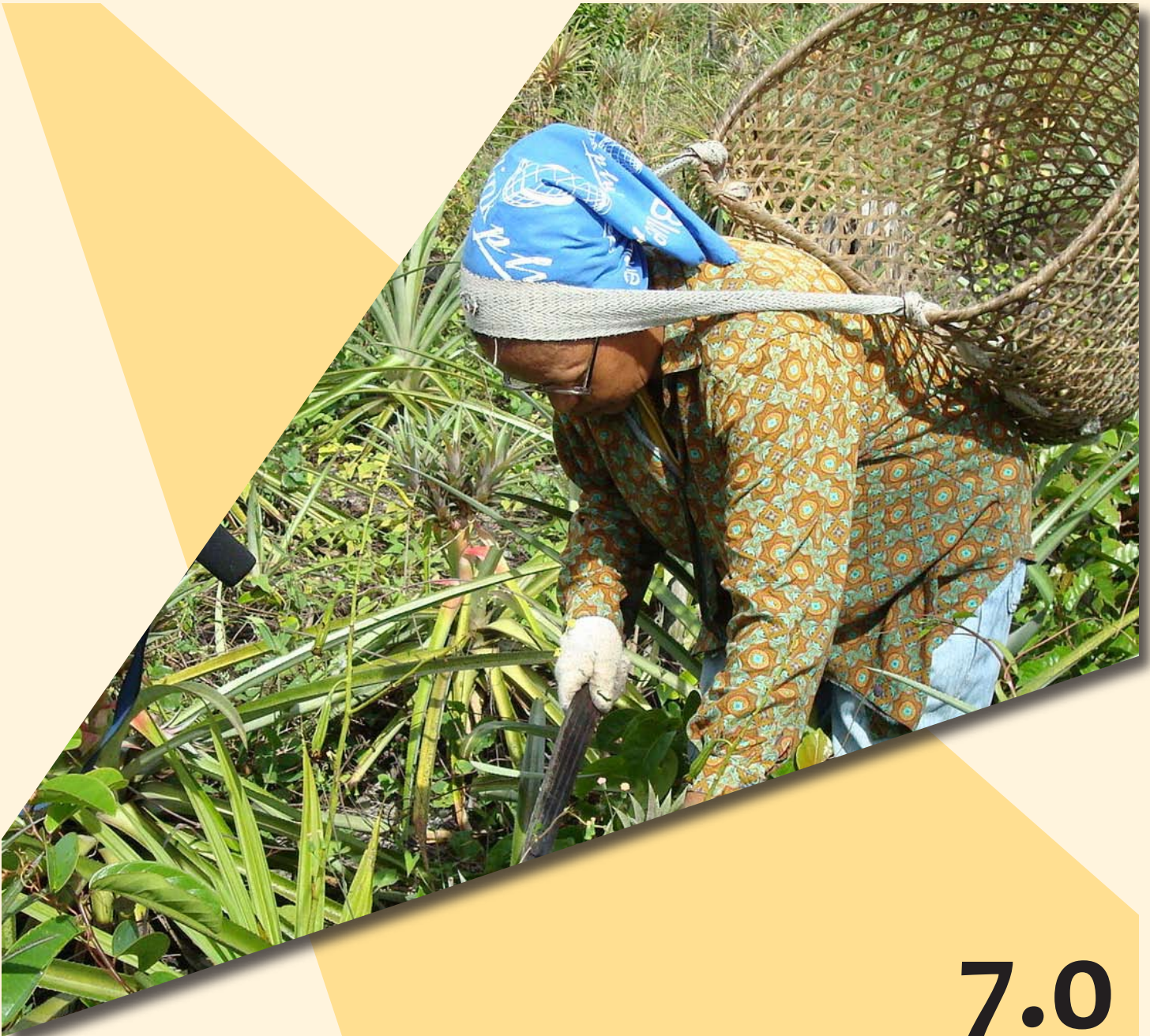
Woman reaping organic pineapples at Mainstay in Guyana