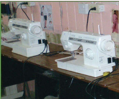
Sewing equipment presented to Project Strong