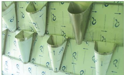
Poultry equipment acquired by Broiler Association

The St. Kitts Broiler Association was formed with the main aim of supplying fresh poultry to the many households, restaurants and hotels. Most of the poultry meat is imported and it is hoped that ultimately the import bill for this product will be reduced substantially. The Association received a grant of US$10,000 for the procurement of three (3) portable plucking machines.