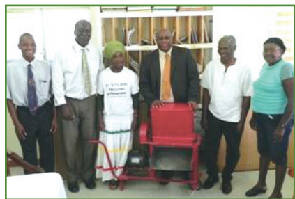
Handing over Ceremony of hammer mill and grater to St. Kitts Agro-processors.