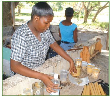
Making candles from beeswax

Beekeeping was introduced in St. Kitts during the 19th Century. However, the practice never became widespread and by 2001, most of the honey produced on St. Kitts was harvested from the wild. A study conducted by IICA revealed that two of the major constraints experienced were unavailability of equipment and low levels of technical knowledge. With the assistance of the Co-operative Department, the St. Kitts Beekeepers' Co-operative was formed.