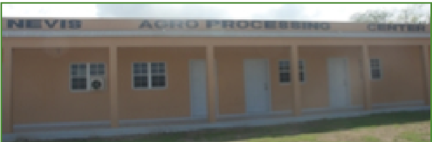
Agroprocessing facility, Nevis.

The New River Farmers' Co-operative in Nevis also benefitted from the assistance of the IICA office. The Society did not have the appropriate infrastructure to store its vegetable produce. Consequently, it suffered from very high post-harvest losses. The Institute assisted in developing a project, which was submitted to the Australian High Commission in Trinidad and Tobago and US$11,000 was received to procure a 'walk-in' chiller in 2011.