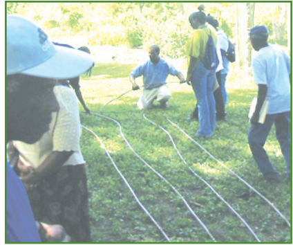
Members of Nevis Growers' Association at Drip Irrigation Workshop

and submitted to the Caribbean Food and Nutrition Institute (CFNI). The CNFI approved the project and US$5,000 was made available to procure 26 rolls of drip line. A drip irrigation workshop was also held to enhance the farmers' competences. The NGA also benefitted from a Grant totalling EC$58,000 which was obtained from the CFLI. This was to procure farming implements and fencing materials.