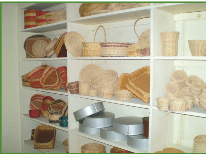
Straw baskets made by Project Strong