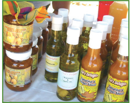
Products made by agroprocessors