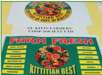
St. Kitts farmers brand label

In November 2007, the St. Kitts Farmers' Co-operative Society and the St. Kitts Marriott Hotel signed a Memorandum of Understanding (MOU) for the co-operative to supply the hotel with vegetables. However, the co-operative did not have the requisite infrastructure to enable the smooth undertaking of this contractual arrangement. The Institute therefore assisted the co-operative to develop a project proposal valued at EC$49,000. This project was funded by the CFLI. The funds were used to procure a "walk-in" chill room (10'x15'x8'), 1500 crates/containers and 50,000 labels. The project also enhanced the capacity of members and strengthened the organizational and management structure of the group. This it did through training in post harvest handling, group dynamics and financial management.