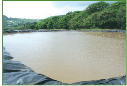
Dam at St. Peter's

The St. Peters Farmers' Cooperative was formed in 2009. One of the main challenges it faced was inadequate water for irrigation. A grant of US$12,000 was made available to construct a 520,000-gallon earthen dam. Drip irrigation pipes for the farmers were purchased.