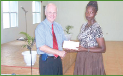
President Fahie’s Agricultural Women Producers’ Association receives grant funds from CFLI

The Food and Agricultural Organization (FAO) in 2008, made available to the Eastern Caribbean Representation of the Inter-American Institute for Cooperation on Agriculture, the sum of US$75,000 to facilitate a set of activities aimed at reducing vulnerability to food insecurity in rural and farming communities, through the strengthening and expansion of rural income streams. This financial contribution assisted the IICA offices to examine the range of agri-business along pre-selected agriculture-tourism food chains, and identify, formulate and start up six income generating projects, one in each of the member states. The project, which was selected in St. Kitts and Nevis and supported financially, was one which was operated by a member of the Fahie’s Agricultural Women Producers Association. The project funded labels, packaging materials, equipment, and training in Good Agricultural Practices (GAPs), Hazard Analysis Critical Control Points (HACCP) and the production of cassava bread. Sandwiches are now sold in several supermarkets in St. Kitts and Nevis.