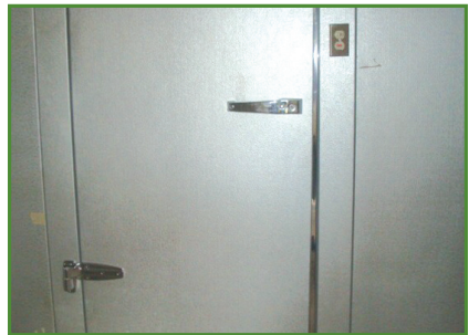
Walk-in Chiller acquired by St.Kitts Farmers

In October 2008, Nevis like other islands of the Eastern Caribbean was adversely affected by Hurricane Omar. The marketing arrangement which was established between the farmers and the hotel and which was regarded as one of the "Best Practices" by the proponents of Agro-Tourism linkages was severely affected. The Institute was able to assist the NGA in developing a Project, which was submitted to the CFLI and as a result the NGA received a Grant totaling EC$43,000. This Fund was utilized to procure seeds, fertilizers, chemicals, fencing wire, drip irrigation and a walk-in Chiller.