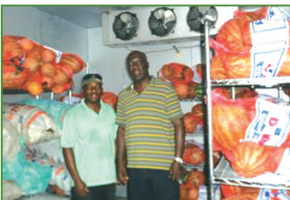
New River Farmers Cooperative Walk-in Chiller

The St. Kitts Agro-processors also benefitted from a grant of US$10,000 from the Australian High Commission to procure a hammer mill and grater. With these pieces of equipment, the agro-processors have been able to fully utilize the cassava, breadfruit and sweet potato. These have been processed into flour to make a number of products. Consequently, this has enhanced the island's food security capability and also increased the agro-processors' incomes.