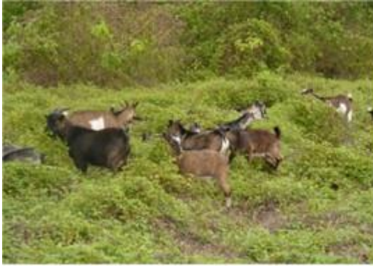
Goats grazing legume pastures in Andros island, Bahamas.

There have been many attempts to develop intensive grazing systems for sheep and goats in the region, but unfortunately most have failed, or have not reached the production expectations. The main reason has been mentioned, the fact that these efforts have had grass species as the main source of forage.