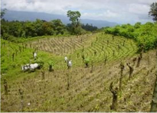
Mulberry in association with Erythrina in Costa Rica