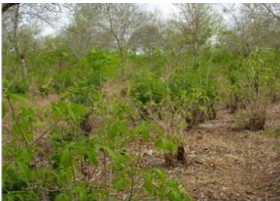
Management of natural vegetation in NE Brazil.

A very interesting system developed in Brazil (Araujo Filho & Carvalho, 1997) for the Caatinga vegetation in the northeast, which involves the removal of certain trees and shrubs, coppicing of others and the planting of leguminous species, increases overall and seasonal forage availability and quality, and consequently, animal performance. The general strategy and the techniques of this work could easily be used to improve the management of natural ecosystems for small ruminant production in several regions and islands.