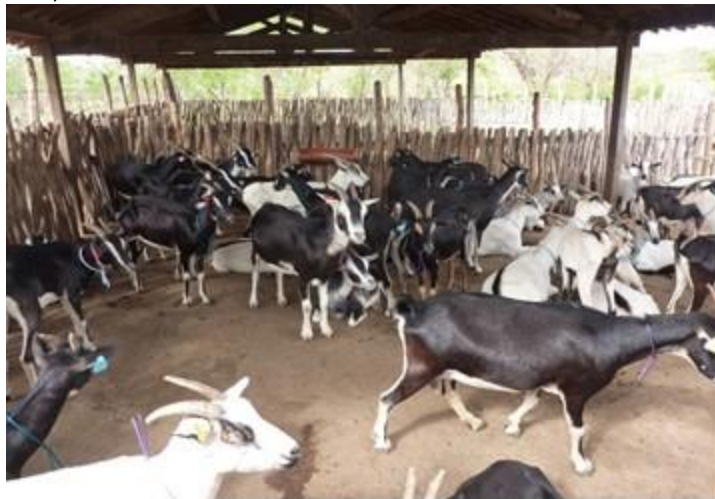
A goat pen with a dirt floor.

An option to resolve the humidity problem is the use of bedding. One of the best bedding materials are wood shavings, but others, like rice hulls and a variety of cereal straws can also be used. The bedding is eventually removed, when it becomes saturated, and is utilized as valuable fertilizer.