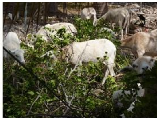
Sheep fed tree leaves in the Bahamas

In the Bahamas, farmers practice pruning of tree branches to supplement their animals in times of forage shortages. For certain trees with very palatable foliage, they prune the branches to keep it out of animal's reach in order to prevent frequent consumption and consequently, tree damage.