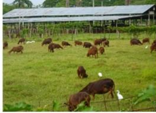
Pelibuey sheep in grass pastures in the Dominican Republic.

The low quality of grasses and the resulting poor animal performance, can be partially compensated by providing supplements, usually agro-industrial by-products or commercial concentrates. However, the profitability of supplementation is often in doubt, unless supplements are acquired at subsidized price or for free.