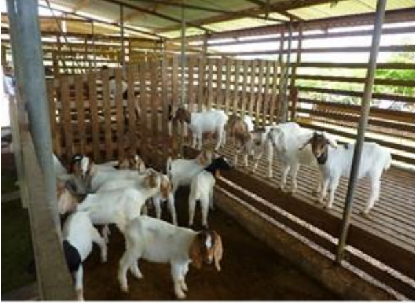
Goats in partial slatted floor.