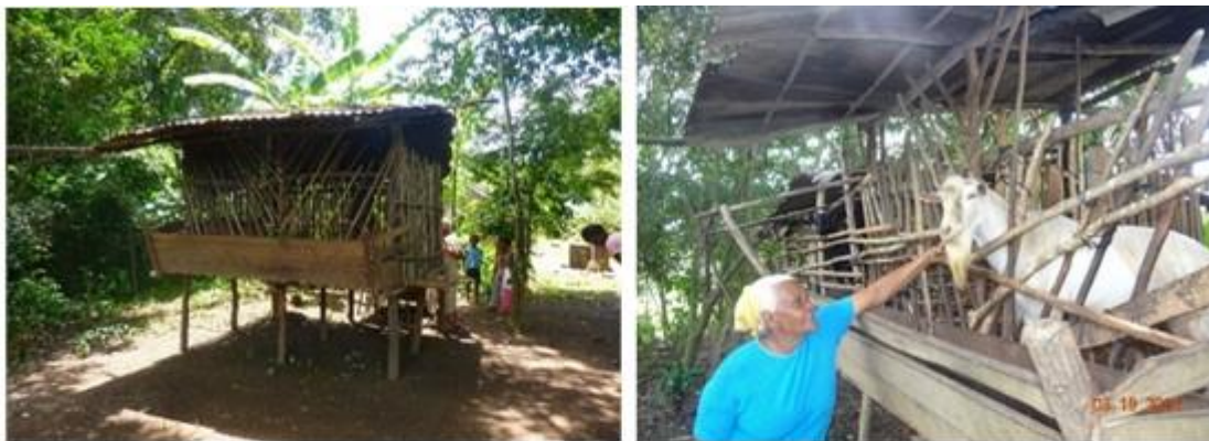
Goats in confinement owned by women producers in the Dominican Republic.

In current slat floors, frequent hoof trimming is necessary to prevent leg problems, since animals do not walk much and the surface is not abrasive enough for normal wearing of hooves.