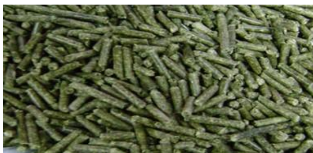
Moringa pellets produced in Cuba.

Pelleting of fodder plants represents a good option to substitute cereal concentrates. The technology for processing and treating forage in the tropics must take into account the following parameters of the raw materials before entering the pelleting factory: mill-sieve diameter, humidity content and meal density. Recent research suggests that in the tropics it is possible to obtain good results with a mill-sieve diameter of 2-5 mm, a moisture content of 12 to 20%, and a density of 90-115 kg/m 3 . These parameters may vary according to the plant species.