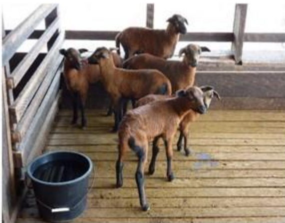
Inadequate water container.

Since potable water should be available at all times, water troughs or dispensers should be easily accessed to animals of all ages. Again, the most important thing is that water does not get contaminated from feed, feces or urine, and for that reason, it should be located at a prudent distance from feeders. Nipples and water troughs with float valves reduce waste and assure availability 24h a day.