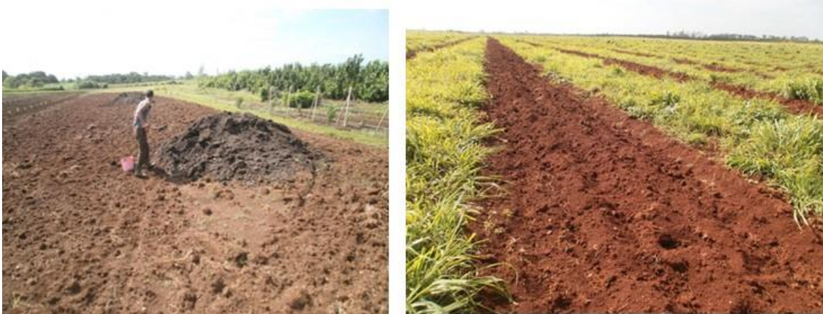
Two ways of land preparation for forage establishment, the traditional system with organic matter application (left) and minimum tillage in rows within established pastures.

The traditional way of soil preparation of the Green Revolution Agriculture, including subsoiling (with a subsoiler or a mole plow), plowing (with a moldboard or a disk plow) and harrowing (one pass and crossing) are still performed, but there are not the best practices nowadays, considering costs and above all, impacts on soil structure and fertility (basically organic matter content). No-till direct-seeding and minimum tillage are alternative ways to plant with less or minimum disturbance to soil structure. These alternative methods might require agricultural implements and machinery not necessary readily available in the tropical countries with less advanced agriculture.