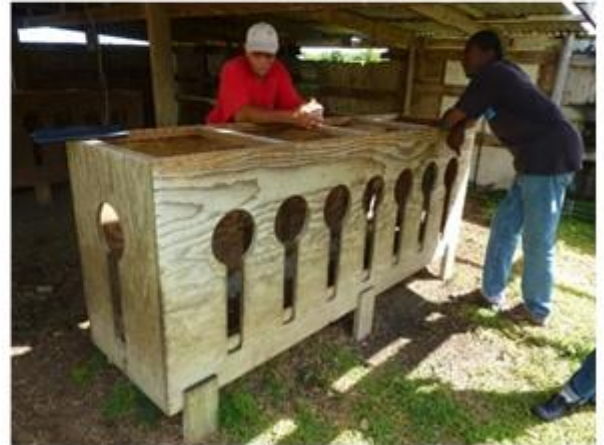
Feeder designed to reduce feed wastage.