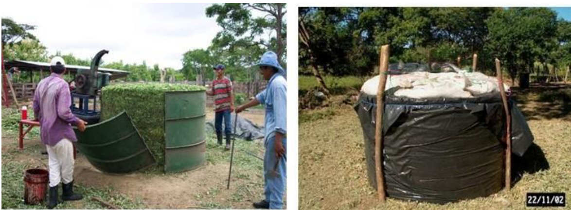
Figure 5. Conservation of Gliricidia sepium and Moringa oleifera by ensiling in Rivas, Nicaragua.

Ensiling trees and shrubs has been successfully done for some species. Silage can be done with green fodder, but pre-wilting (4-6 hours under full sun) can reduce protein degradation during conservation. Cutting thin particles (2 cm or less) improves compaction of lignified stems and leaf, and plasmolysis can be artificially accelerated. Conservation also may reduce anti-nutritive factors.