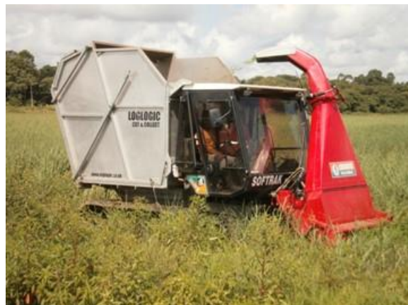
Grass harvester in Suriname.

Mechanical harvest. There are not many examples of mechanical harvest in the region. However, in the case of herbaceous legumes it would not be difficult to adapt the grass harvesters as the one showed in Figure 5.