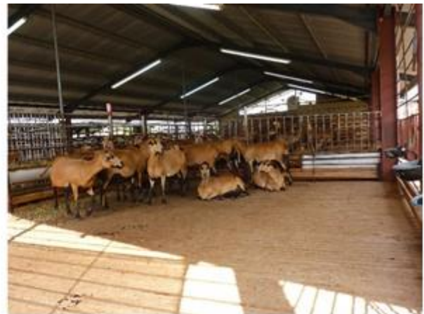
Ample pen with adequate drinkers.