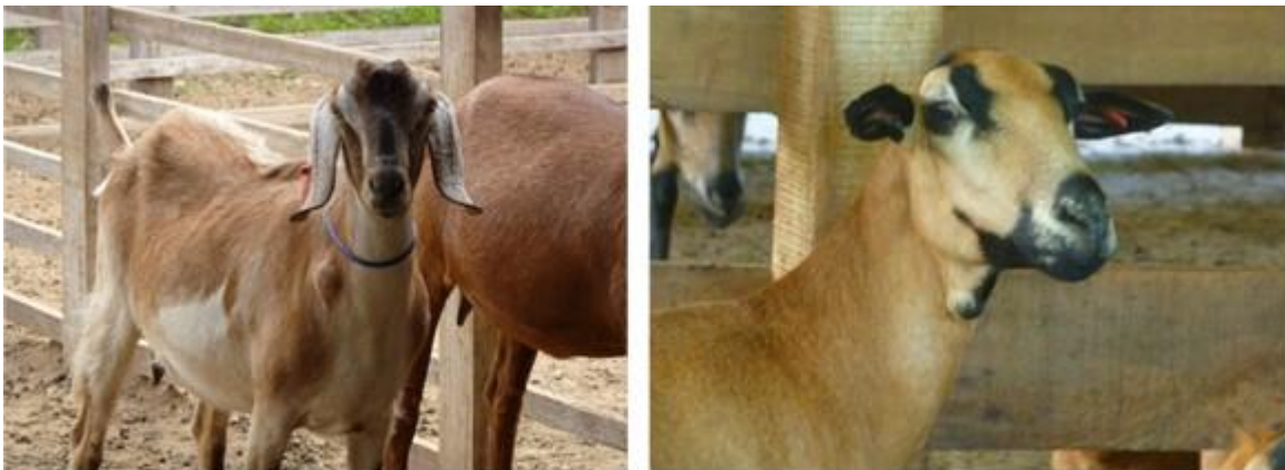
Animals with Caseous Lymphadenitis

It is worldwide chronic and very contagious and zoonotic disease caused by the bacteria Corynebacterium pseudotuberculosis . It is present in most islands in the Caribbean. The external symptoms are the inflammation of the lymph nodes and the eventual rupture if not intervened before, but abscesses also form internally in thorax and abdomen. The pus-like substance is the main means of contamination of skin lesions. The bacteria remains in the premises for a long time and it is difficult to disinfect. The disease is a major cause of carcass condemnation and meat trimming of damaged tissues, but there are also economic losses due to affected growth and performance. It is an important disease that deserves the attention of the regional health authorities. There are vaccines for this disease but their effectiveness in national programs is unknown.