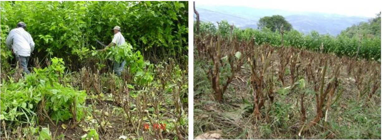
Manual harvesting of mulberry with machete in Costa Rica.

Manual harvest. In small and medium size farms, harvesting is done with machetes, scissors or small mowing machines. The cuts should be performed as clean as possible, with an upward movement preferably, which reduces cortex tearing on the stumps, favors healing and reduces the chances of infection. Other cutting implements (e.g. sickles) are used in some countries for herbaceous forages.