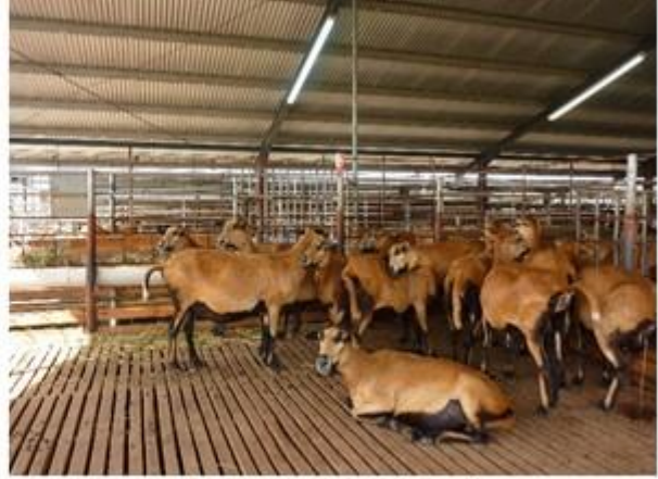
Slatted floor in Trinidad.