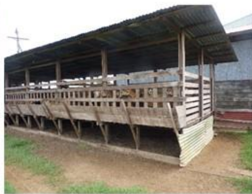
Elevated barn in Suriname