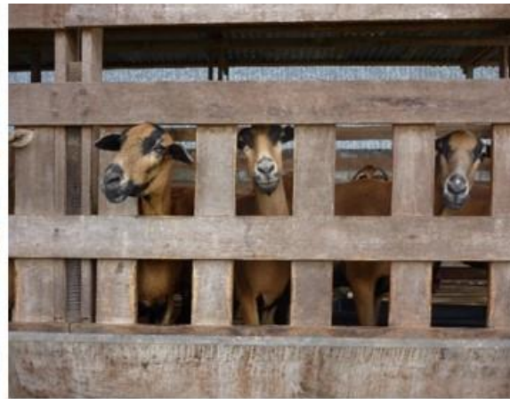
Access to feeders.