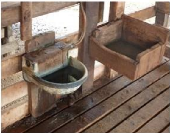
Automatic water trough and salt-mineral feeder.