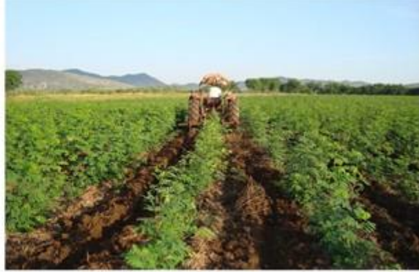
Leucaena cultivation in Mexico

High quality forage species can be integrated in small ruminant farms in different planting arrangements (Sanchez, 1999). Table 2 describes some of these options: