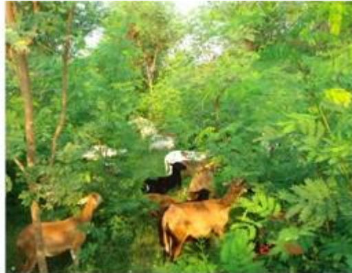
Sheep in silvopastoral system in México.

for small ruminant production in tropical areas and have opened a large opportunity for yield increases and business. The rotational use of paddocks maximizes forage performance, and the combination of better animal nutrition and health, with minimum exposure to larvae virtually eliminates the internal parasite problem. The Cuban version of the intensive silvopastoral systems for bovines, containing climbing legumes in addition to the leucaena in the browsing component, is also being successfully used for small ruminant production in that country.