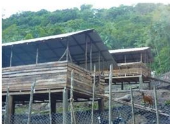
Elevated pens in Saint Lucia