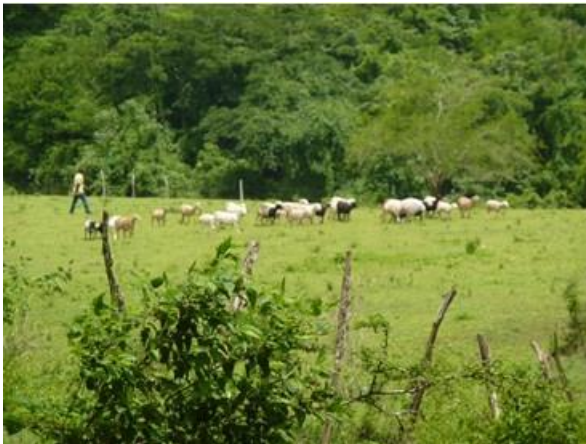
Free ranging sheep in Jamaica.

Goats in the Caribbean and Latin America have not yet learn to climb trees as they do in North West Africa, skill which allows them to ingest leaves and pods unavailable from the ground level.