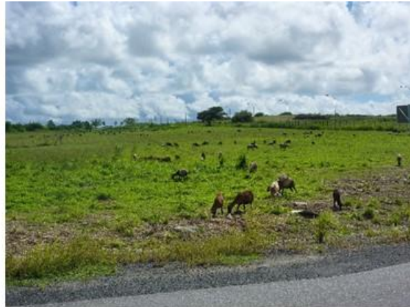
Free ranging sheep in Antigua.