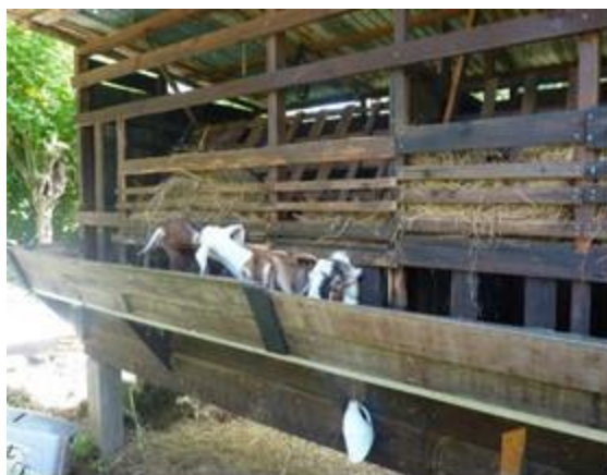
Goats on low quality hay.