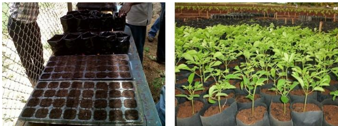
Nursery trays and young plants.

Both seeds and vegetative material can be planted first in nurseries before transplanting to the field. In a greenhouse or in a nursery, plants can be sown in plastic bags of different size depending on the species. In addition, they can be sown in trays, like the ones used for vegetables (Figure 3), or other containers like recycled containers including bottles and tetrapacks.