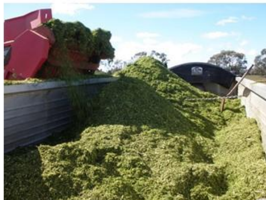
Mechanical harvest of leucaena harvester in Australia

In some Central American and Caribbean farms, it is common to pass all harvested through a chopper before feeding it to the animals. There are dairy goat farms in Costa Rica where they harvest mulberry and King grass, chop them and then mix them in a proportion of 75-80% mulberry and 20-25% grass.