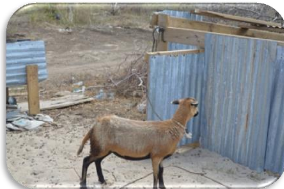
Image of the Black Belly breed sheep