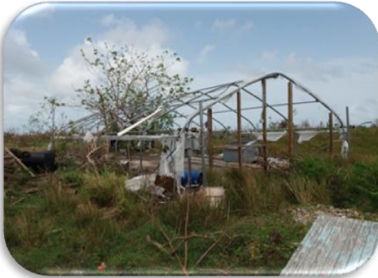
Greenhouse condition after the effect of Hurricane Irma