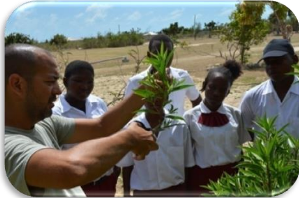
Students learning how to clone plants using cuttings