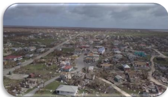
Images showing the path and results of Hurricane Irma ( http://fox6now.com )