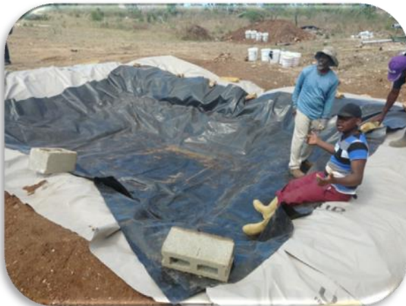
Installation of pond liner in tilapia pond