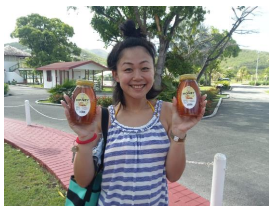
Antigua & Barbuda Honey marketed to Japan