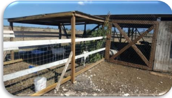
Farmers implementing the cut and carry feeding system