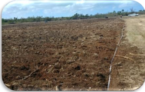
Land preparation on pasture demo plot