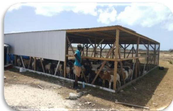
Upgraded livestock housing unit