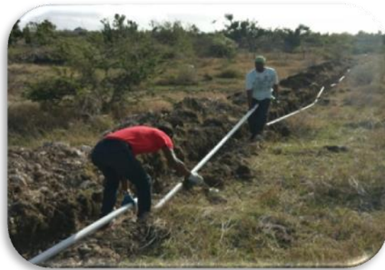
Established Chrysopogon grass species material bank Installation of irrigation sub-main pipes for demo-pasture