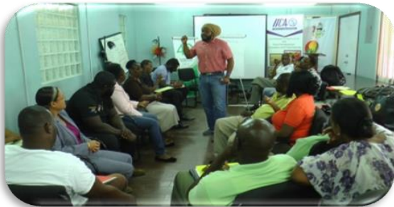
Climate Change Workshop for Technicians

The RRA has prompted interest to advance support from IICA towards increasing knowledge, information and methodologies on how to anticipate, prepare, respond and recover to environmental risks (extreme events). The technical areas identified included agricultural risk management tool kit with risk management protocols, methodologies to undertake damage assessment and rehabilitation/recovery plans.