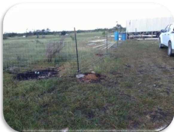
Paddock upgrade for livestock

Seven farmers in Barbuda were supported in rehabilitation the farmers were responsible for the labour involved in the repairing the pens and paddocks. A total of four new paddocks were newly installed while an additional three were repaired. As a result of the hurricane the scarcity of forages was limited, twenty farmers were beneficiaries of diary feed supplements procured under the projectsto assist in improving their stocks nutrition and health.