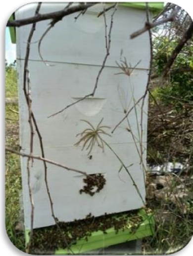
Inspection of destroyed hives after Hurricane Irma Replacement of new durable hive bodies.