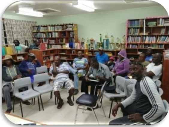
Farmers participating in Small Ruminant Management Training session