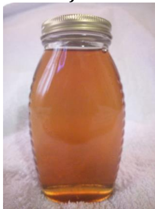
Improved labels according to standards