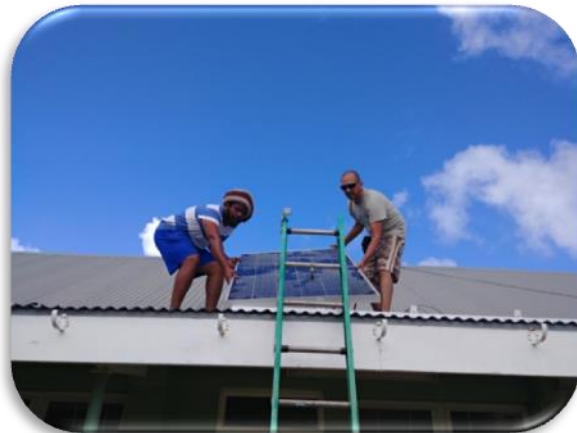
Installation of Solar Panels for greenhouse system