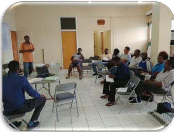
Training session Bee Co-operative