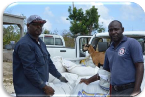
Farmer receiving livestock and input supplies

Through a collaborative effort between IICA, CARDI, MoAFBA and the Private Sector the cooperative members in Barbuda were beneficiaries of ten high bred sheep. The Hall Farm in Antigua donated four female Black Bellywhile Byron Lee Farm donated six male Black Head. Both breeds are able to tolerate heat and exhibit more stamina than most breeds of sheep, thus selecting these breeds for Barbuda were ideal for the climatic conditions in Barbuda .These animals will be in the custodian of the cooperative members who will undertake the responsibility of the breeding and management in an effort to improve and increase the sheep population as well as the marketing of mutton in Barbuda.