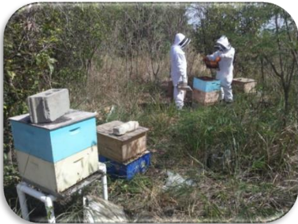
Beekeepers removing swarms & monitoring colonies with new equipment under the projects